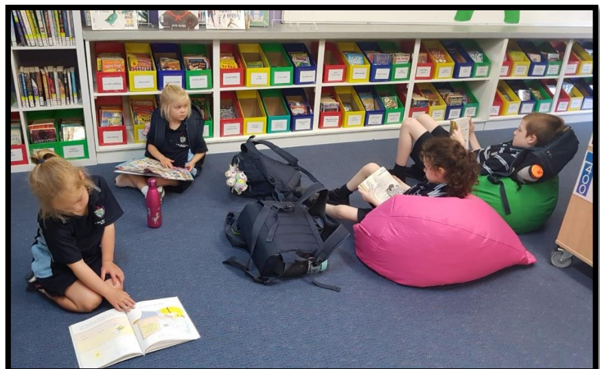
Moonta mini bus students enjoy reading waiting for the bus