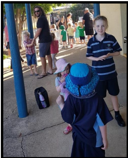
Meet and Greet Evening