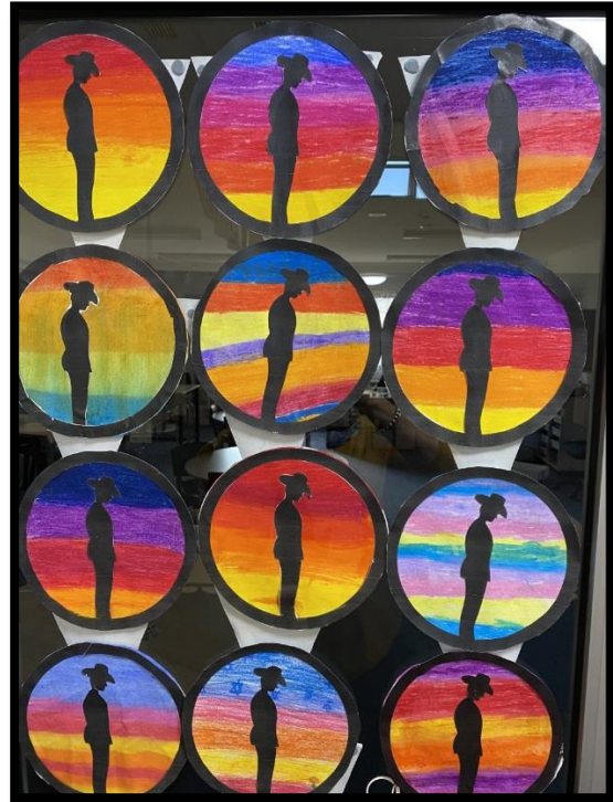
ANZAC artwork by the Year 5/6 students.