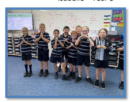
Year 4/5 students

We are working towards creating a whole school prayer book that can be used for class prayer, meetings and school events. Students are very excited to share the wonderful prayers they have created.