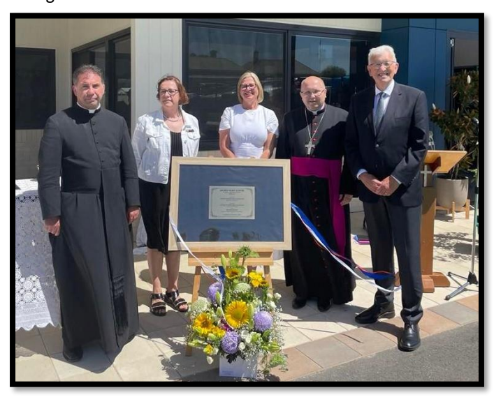
Blessing and Opening of Sacred Heart Centre

The day yesterday was very valuable and allowed us much appreciated time to work on SEQTA and Personalised Plans for Learning.