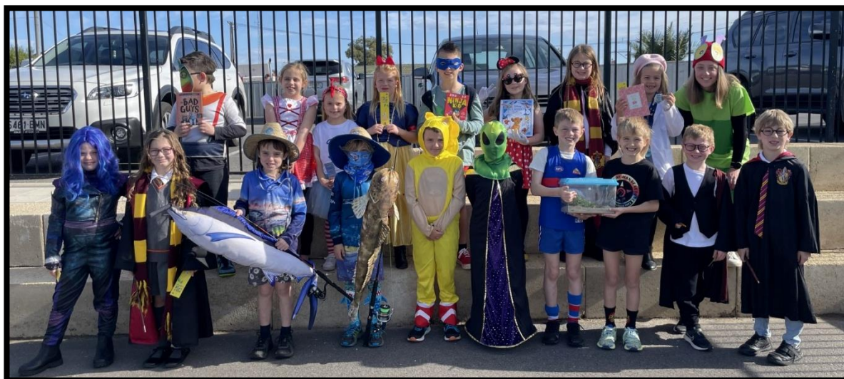
Year 2/3 Wehr