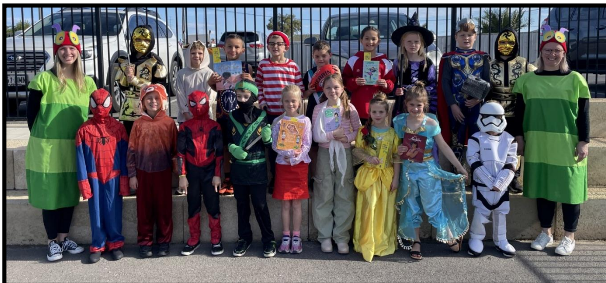
Year 2/3 Norton